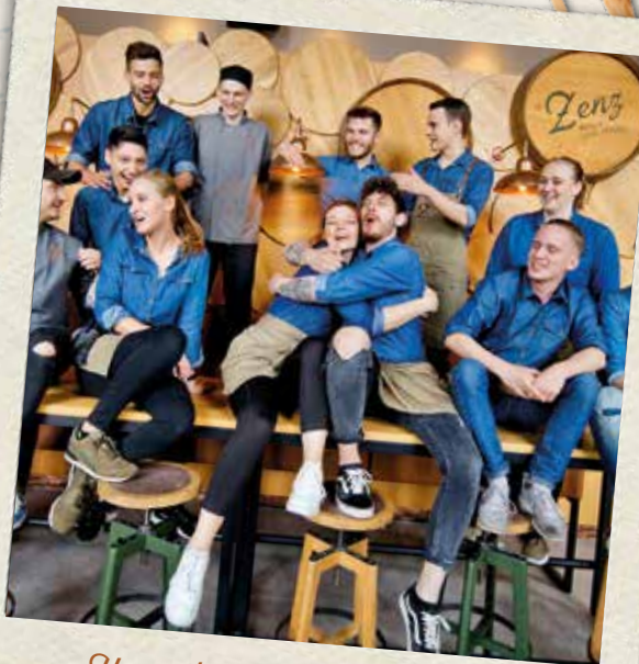
Have a look at Zenz's photo album and follow her on Instagram: @zenz_wirtshaus 📷