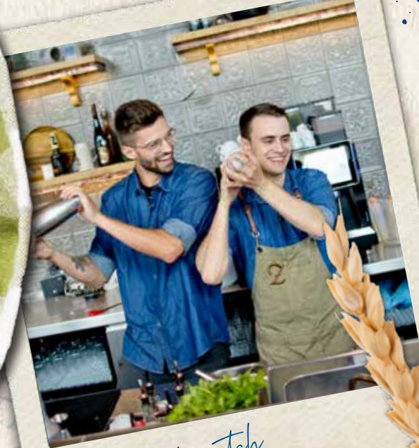
The perfect match for every craving ...